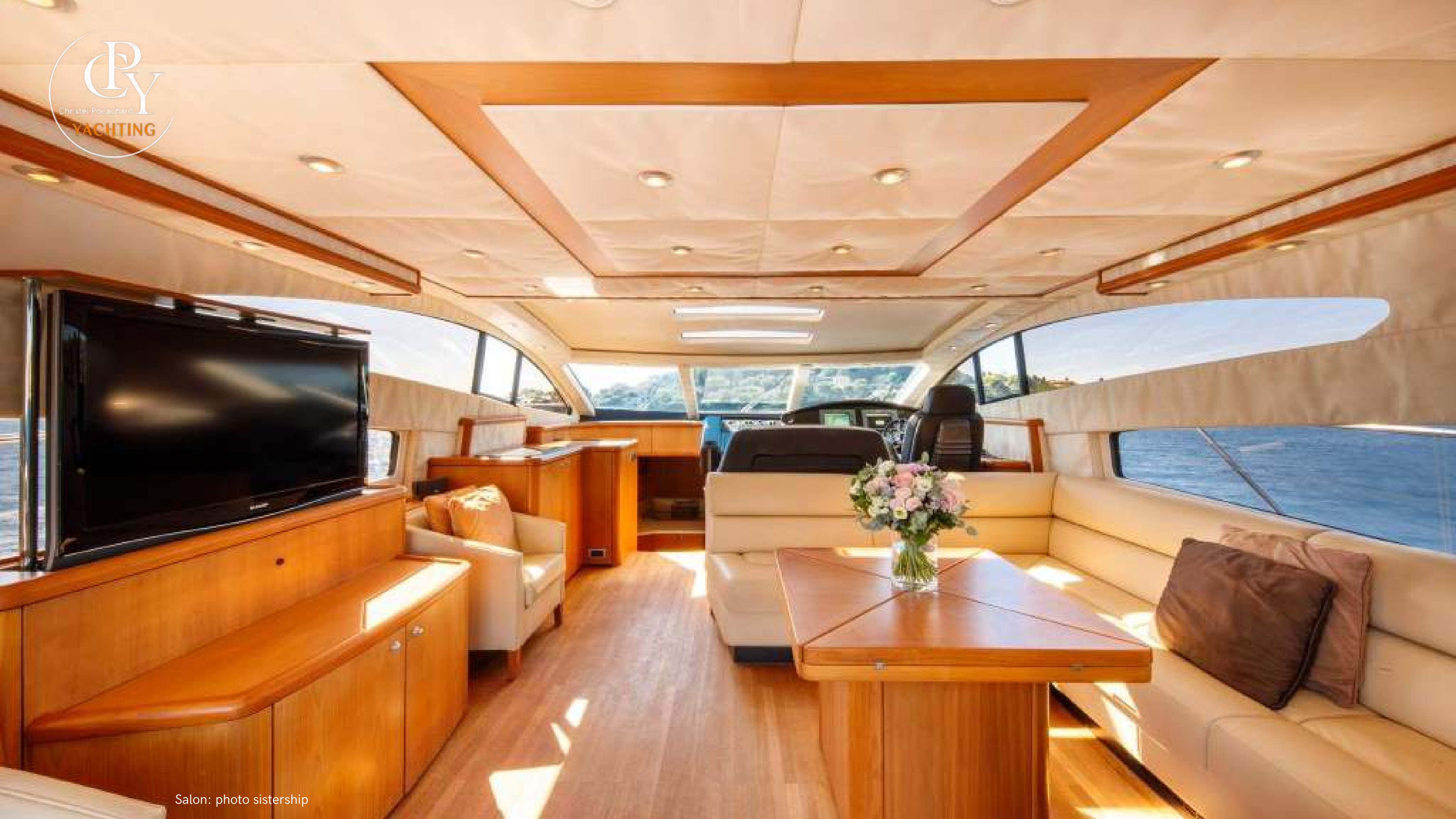
Salon: photo sistership